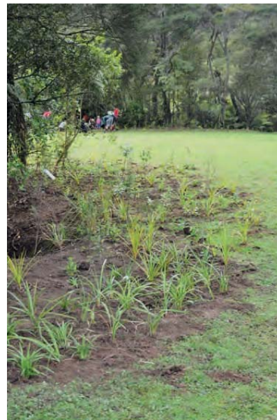
ABOVE, TOP Ladies get involved in native plantings, Kaipatiki streamside (Photo: The Kaipatiki Project).

There is growing international recognition that ecological restoration should not be limited to enhancing species diversity per se, but should also concern itself with restoring the vitality of natural interactions between species such as pollination and dispersal. In this context, the Kaipatiki Project provides a good example of a more holistic approach to ecological restoration. By targeting a species, which has strong positive interactions with many other species, the capacity of an ecosystem to restore itself through natural ecological interactions can be re-built.